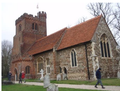
Sandon 11 th century Church